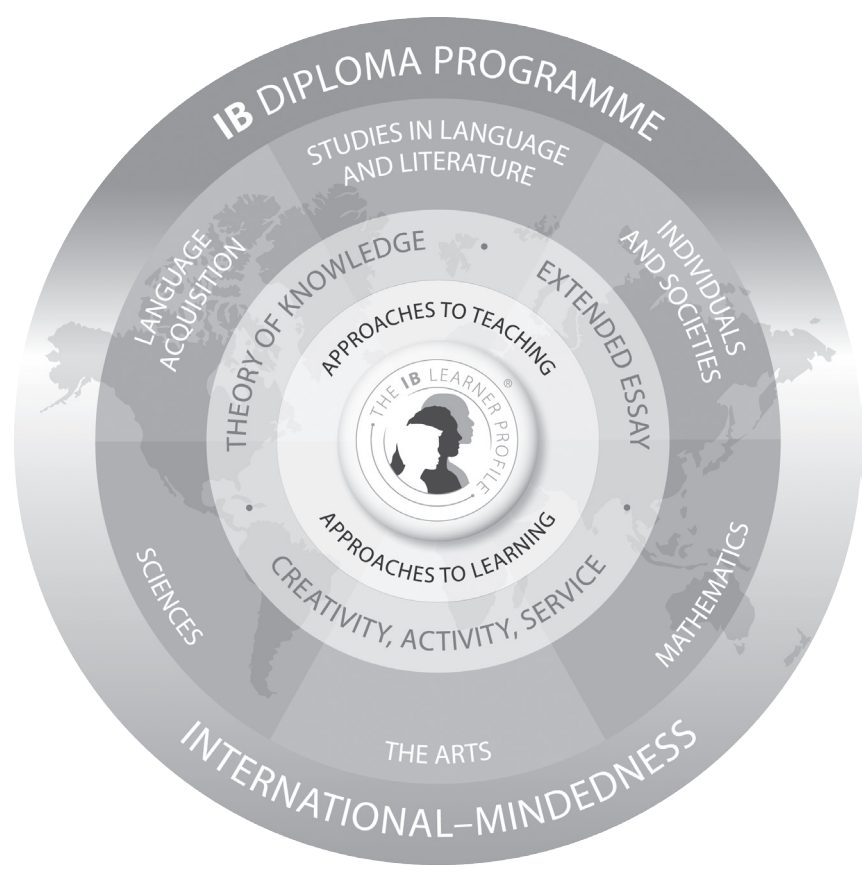
Figure 1 Diploma Programme model

The course is presented as six academic areas enclosing a central core (see figure 1). It encourages the concurrent study of a broad range of academic areas. Students study two modern languages (or a modern language and a classical language), a humanities or social science subject, an experimental science, mathematics and one of the creative arts. It is this comprehensive range of subjects that makes the Diploma Programme a demanding course of study designed to prepare students effectively for university entrance. In each of the academic areas students have flexibility in making their choices, which means they can choose subjects that particularly interest them and that they may wish to study further at university.